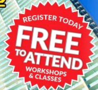
Exhibit Hours: 10:00 a.m. to 3:00 p.m. Classes Start at 9:30 a.m. Each Day